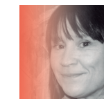
Luned Rhys Parri Cymru → Galiza Artow heblyth / Visual arts