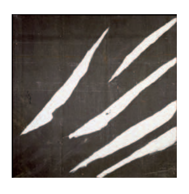
Untitled (Treatise on Melancholia), 1989 Oil, plaster on impregnated canvas The artist's collection