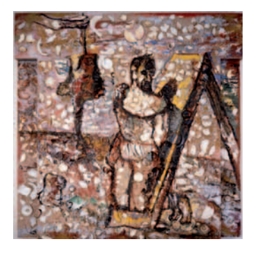
The Red Sky , 1984 Oil, dishes, wood filler on wood Private collection