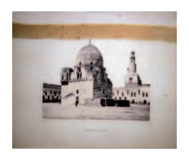
Flaubert's Letters to His Mother, 2005 Ink on polyester The artist's collection