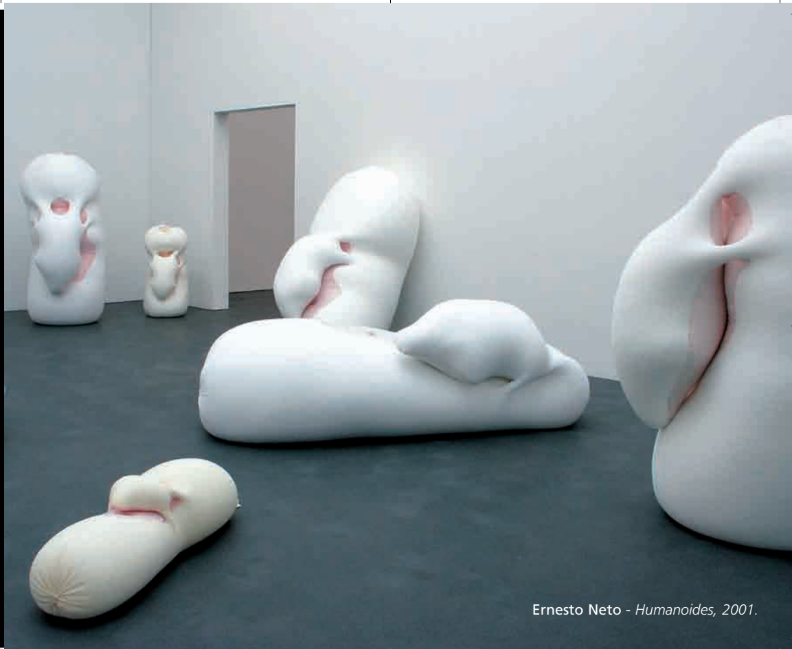
Ernesto Neto - Humanoides , 2001.