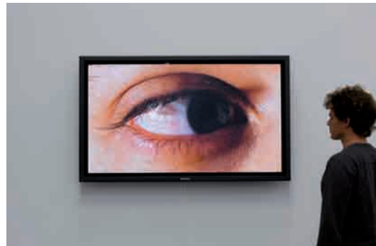
Rafael Lozano-Hemmer - Tensión superficial , 1991-2004.