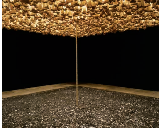
Cildo Meireles Missão / Missões (Como construir catedrais), 1987.