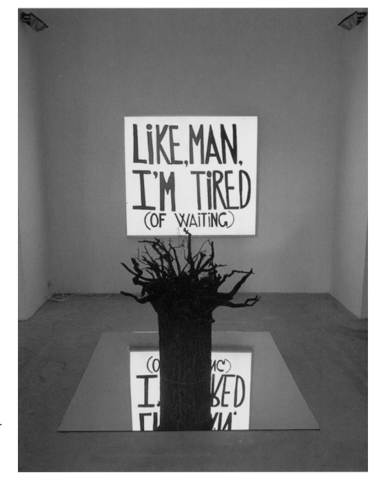
Durant. Like, Man, I'm Tired of Waiting. 2002. Courtesy the artist, Blum and Poe, and Galleria Emi Fontana.

"partially buried." "I read it as a grave site," Durant says of Partially Buried Woodshed , but it is a fertile one for him.<sup>52</sup>