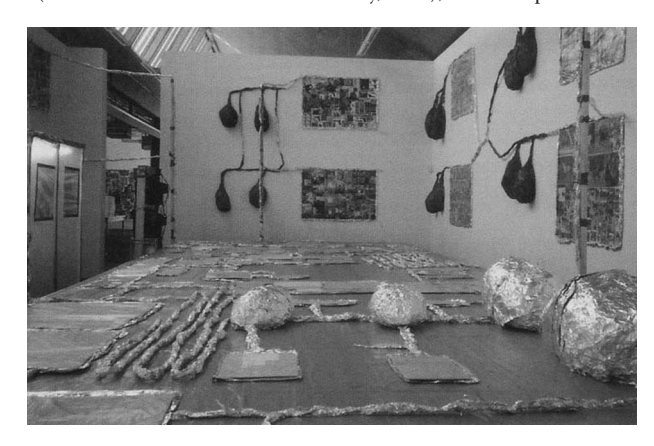
Thomas Hirschhorn. Tränetisch. Kunstmuseum, Luzern, 1996.