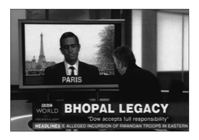
The Yes Men. Dow Does the Right Thing. 2004.