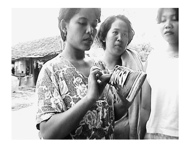
Blum. Two stills from My Sneakers. 2001.

with viewers, whose various configurations of knowledge and "horizons of expectation" determine whether something is plausible to them . While something similar is true of any artwork—that its meaning is produced in the encounter with the spectator—a parafiction creates a specific multiplicity.