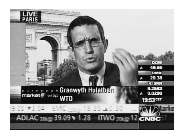
The Yes Men. End of the WTO. 2002.

positive identity correction, the target is made to announce strategies and transformations that are salutary from the point of view of the corrector, and that the actual person or entity must then choose to ignore or deny.<sup>28</sup>