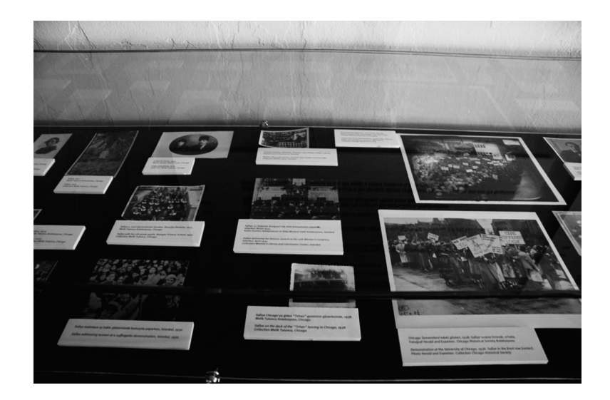
Blum. Detail of A Tribute to Safiye Behar. 2005.

However, this can be particularly destabilizing for scholarship. No matter