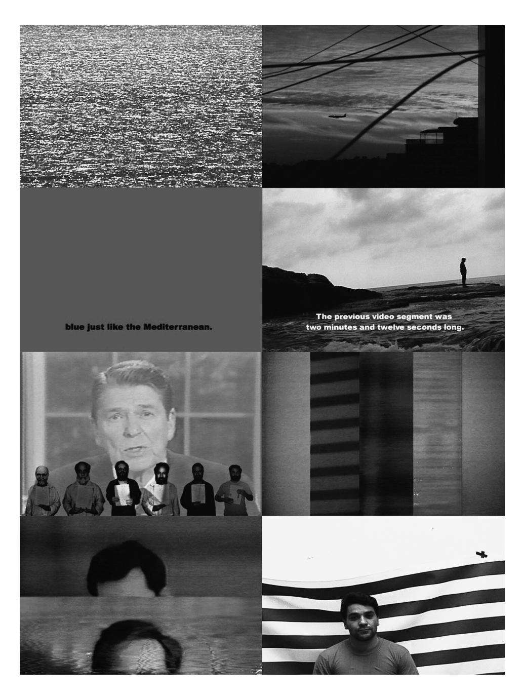
Walid Raad. Hostage: The Bachar Tapes (#17 and #31) English Version. 2000. ©Walid Raad. Courtesy of the Paula Cooper Gallery.