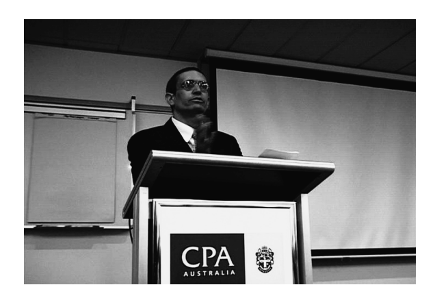
The Yes Men. Might Makes Right. 2001.

acts—as long as the speakers were "in positions of authority." They lacked such authority, but given a URL and a change of clothes, they could literally make-believe, convincing some people, some of the time, that they had it.<sup>32</sup> This is, perhaps paradoxically, both to use and to undermine the authority they target. The Yes Men put it this way: "It seems people can accept just about anything if you're dressed in a suit."<sup>33</sup>