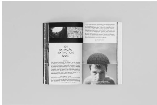
Salomé Lamas: Parafiction / Selected Works (2016)