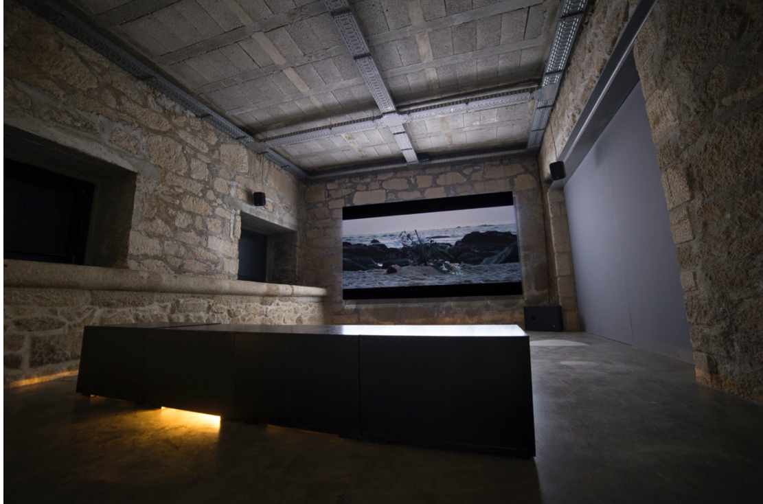
Ubi Sunt II (2017) Salomé Lamas: Solo, Solar – Galeria de Arte Cinemática, Portugal 2017