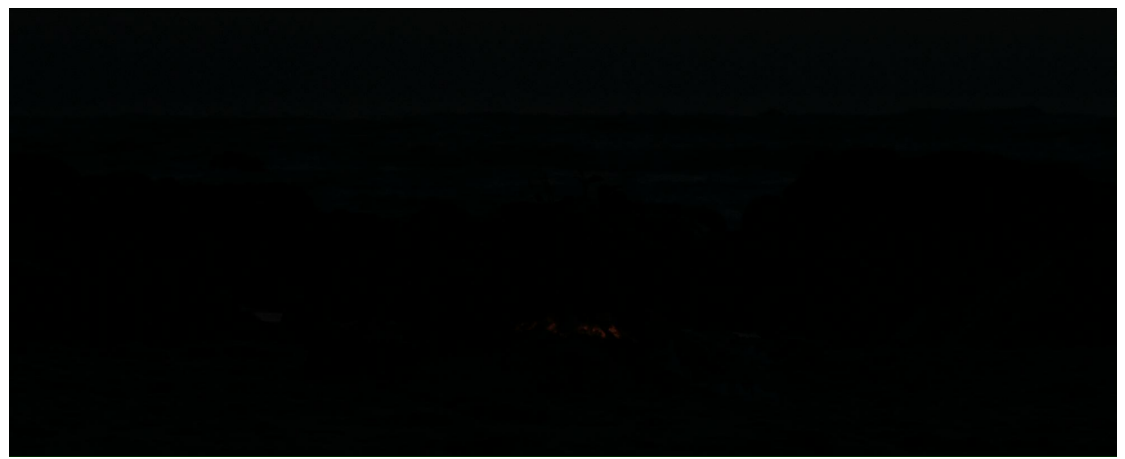
Ubi Sunt II (2017)